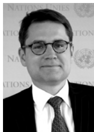
Brian Mikkelsen The Danish Minister for Economic and Business Affairs

Investors can therefore benefit from PRI collaboration, and it is hoped that these guidelines can help show them how.